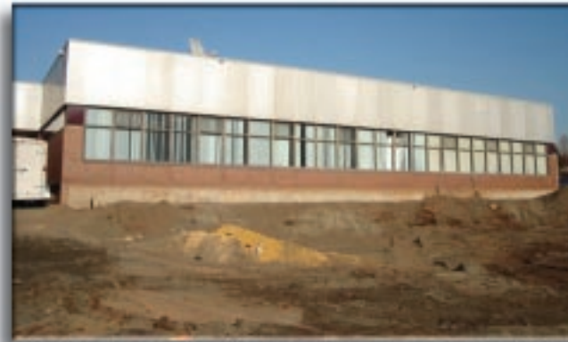
East wall to be excavated 13'.

After assessing the situation, it was determined that the only course of action would be to install 56 Ram Jack commercial brackets with deep driven steel piers. Ram Jack installed custom-built 16 feet guide sleeves and 2-7/8" deep driven powder coated carbon steel pipe to load the bearing strata 40 feet below grade, thus stabilizing the wall. Two feet below the brackets, they installed the first row of tiebacks every 4 feet, resulting in 3 tiebacks per each driver pier. Essentially, they dug out in 5-foot increments, put tiebacks in and attached wire with about 8 inches of shotcrete underneath, tied everything together, effectively building one wall all the way around, encasing all of the piers. Because the soil was a fill, this was the only way to bring the wall down the required 15 feet. The only alternative for the Vocational School would have been to do without the basement and build on a slab once again.