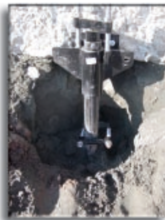
First tie back is secured.