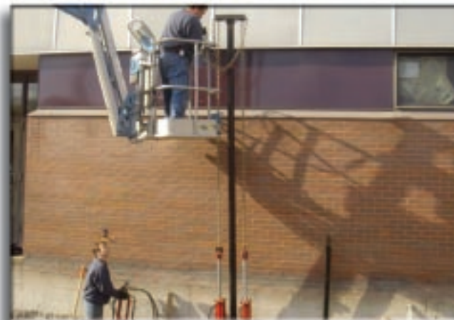
A bucket lift was necessary to install the 16' long guide sleeves.